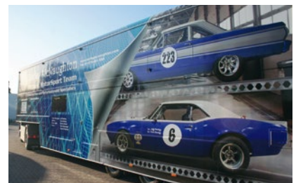
Examples of vehicles applied with the printed ORAJET® wrapping series