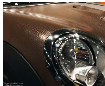
Examples of applications of ORACAL® 975 Premium Structure Cast